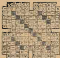
Answers to Puzzle

If you want a USAFI course call Buffalo 21 and you will be taken care of.